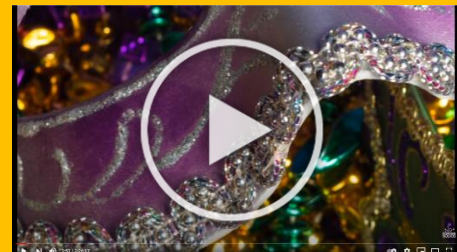
2 Hours of Mardi Gras Music

On Tues. March 1 at 7pm you can watch a special free episode of The Augustine Institute Show focused on Mardi Gras and preparing ourselves for Lent. Click above.